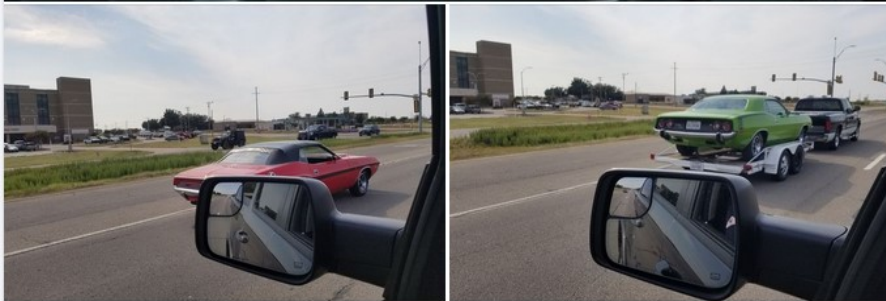
Near Greenville, Texas - Hwy 69