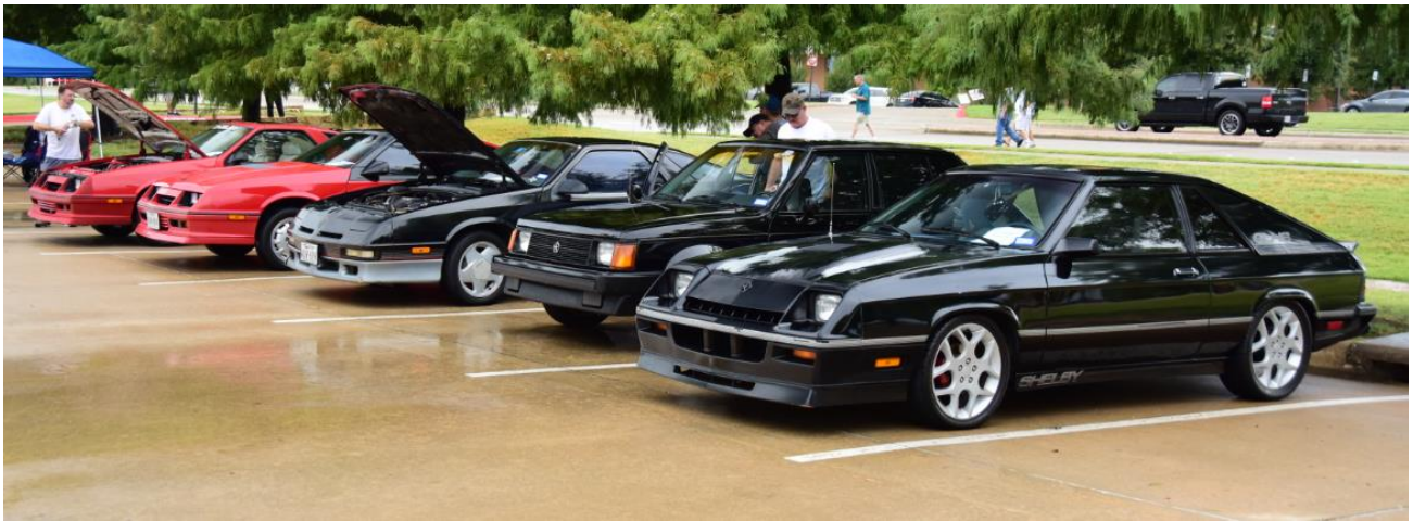
Lone Star Shelby Dodge Auto Club