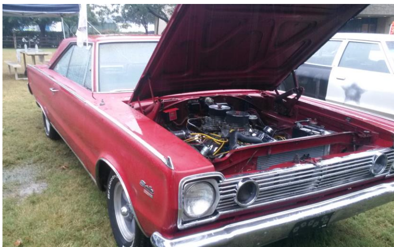
Robert Vaughn's '66 Satellite