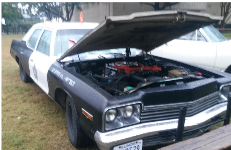
Ken Pool of Cow Town Mopars '74 Dodge (Blues Brothers Cop Car)