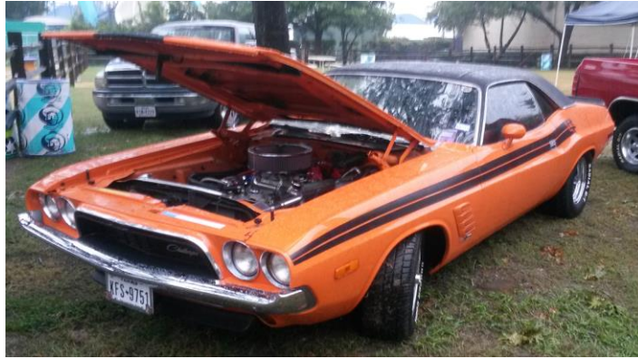
Jim Steinman of Cow Town Mopars '73 340 4 speed Challenger. Over 500 horsepower

Dallas Mopar Club attended the Texas State Fair October 13 th . It was a rainy day in the Car Corral and the club members made the best of it. A few members of the Cow Town Mopars also participated with the DMC at the State Fair.