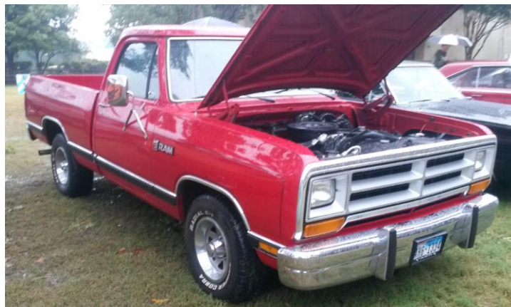
Jerry Reed's '87 Dodge D150