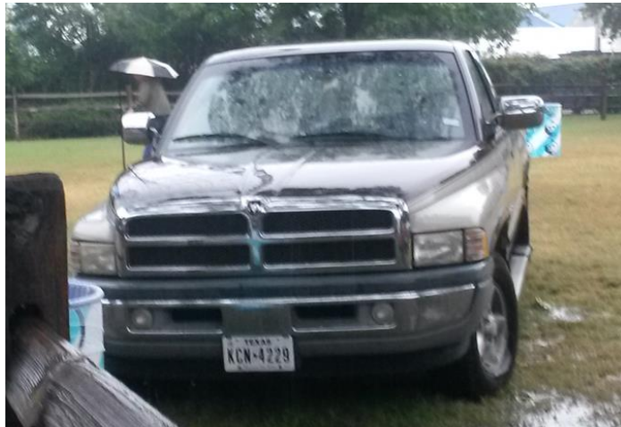
Bob Ostrowski's '97 Dodge 1500