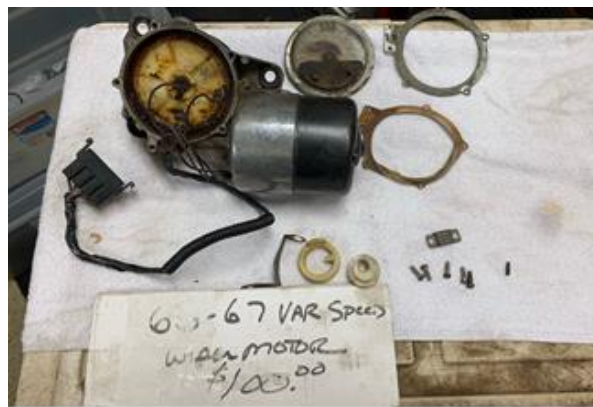
66-68 variable wiper motor.