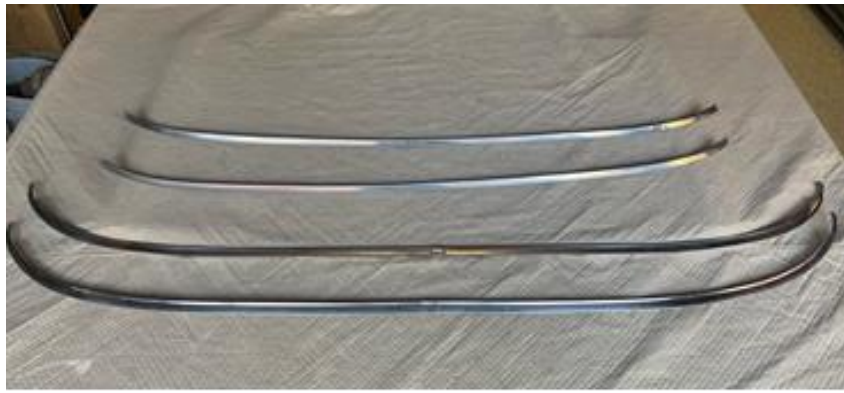
One set of 4-wheel lip moldings for 66-67 Charger.