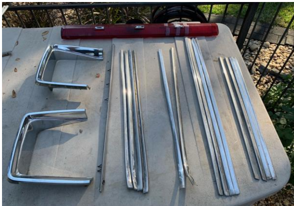
Various stainless-steel trim and complete 11-piece 66-67 Charger interior trim set

Various stainless-steel trim and complete 11- piece 66-67 Charger interior trim set.