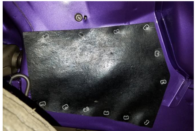
Driver side from inside of wheel well.

www.PLYMOUTHCUDA.com Restoration tips,cars,parts & More