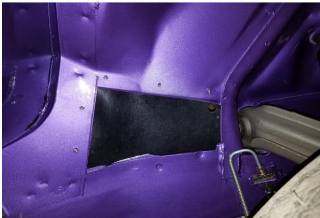
Passenger side from inside of wheel well

As shown on Clint's website www.plymouthcuda.com among other restoration tips: