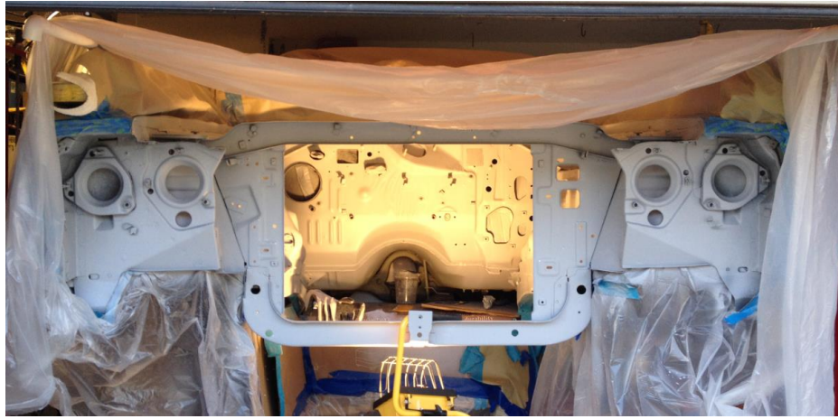
Primed Before ^ After paint