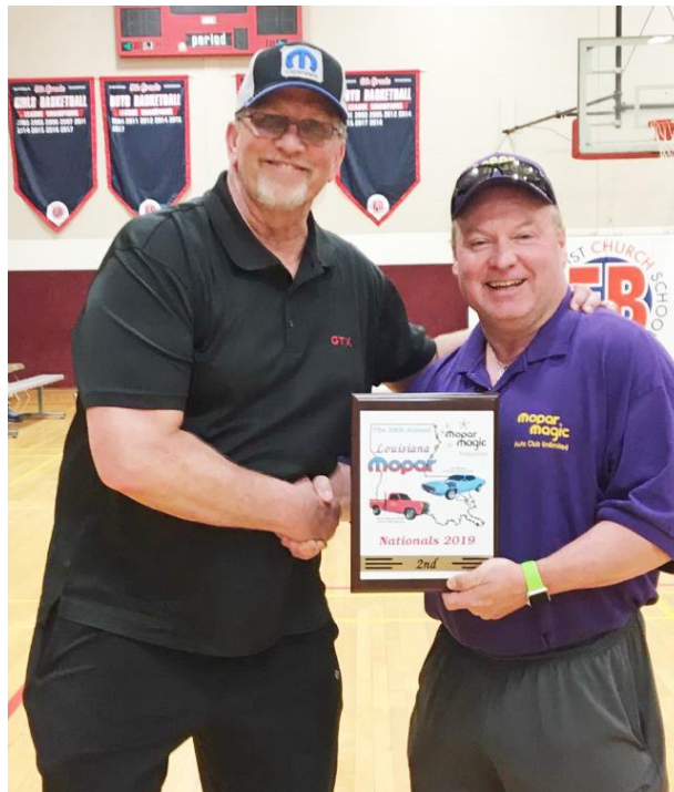
Brad & Beck's - '69 GTX