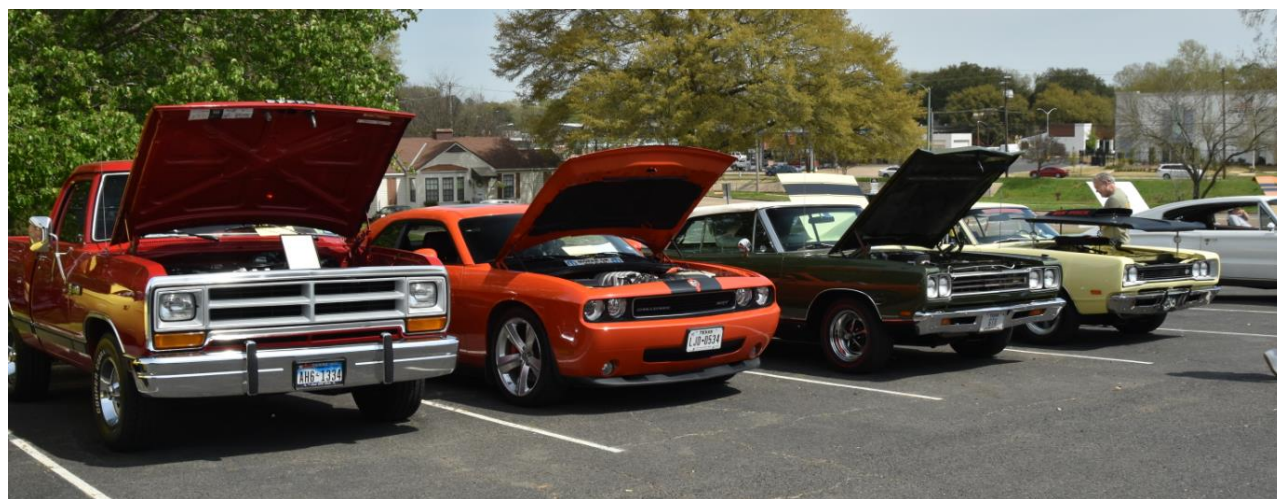
Dallas Mopar Club vehicles that made the Mopar Magic Car Show