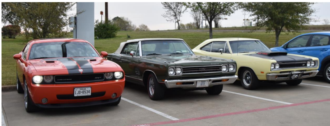
Some of DMC the cars '09 Challenger SRT8, '69 GTX & '69 Super Bee in Marshall, TX