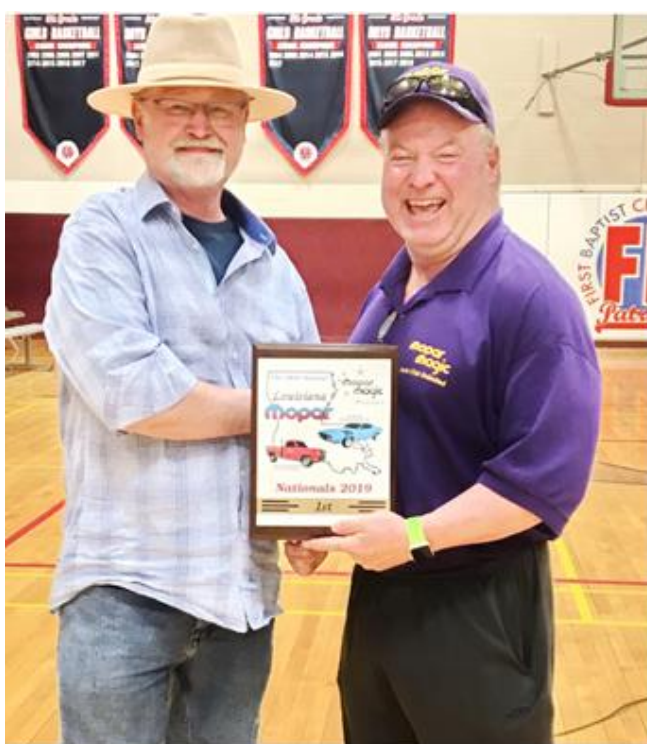
Jerry's - '87 Dodge Ram Pickup