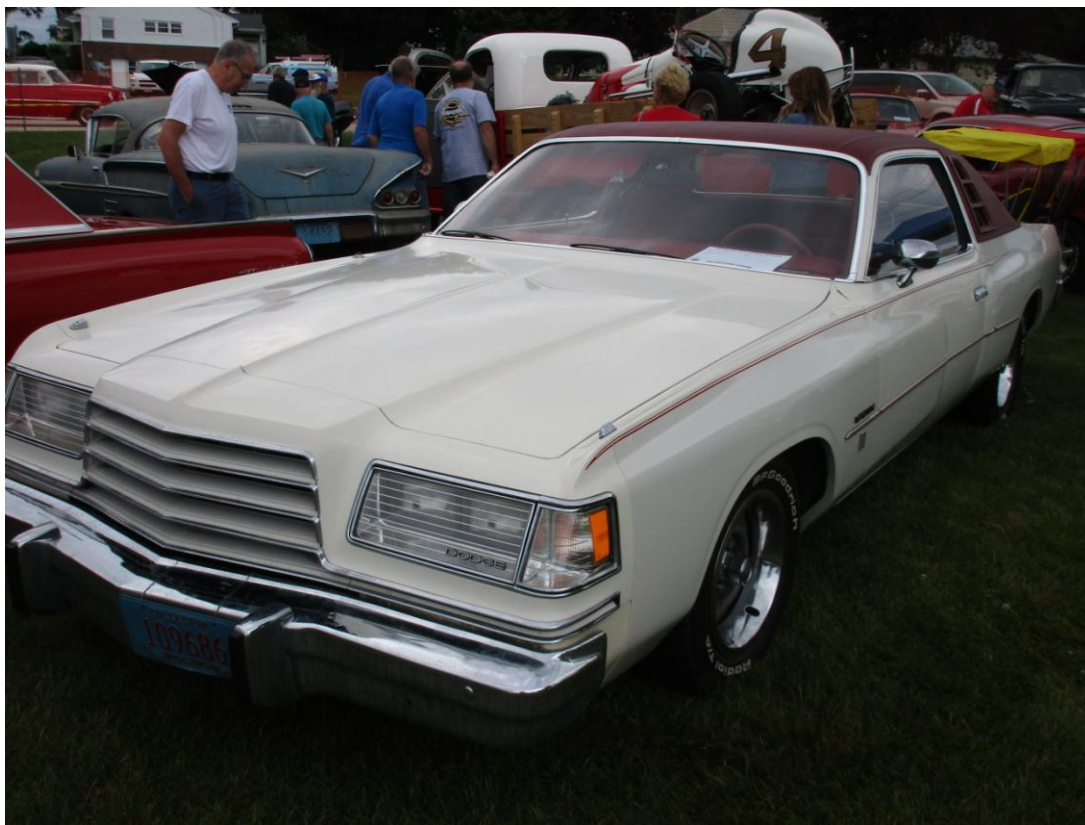
78 dodge magnum