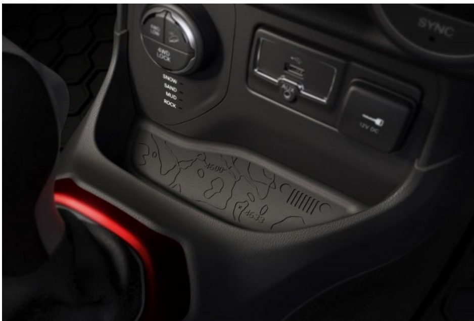
Another Jeep logo in center console Tray