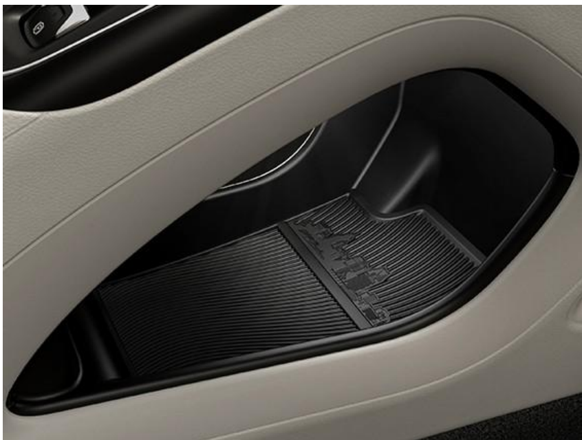
Chrysler 200 Center console