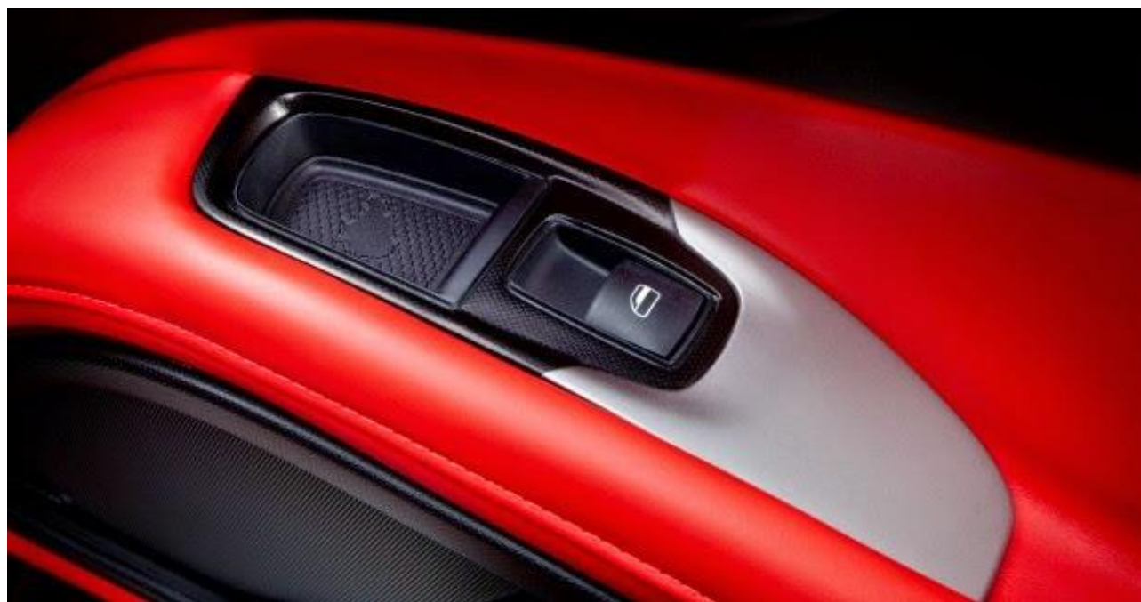
Viper SRT Track map of Nurburgring