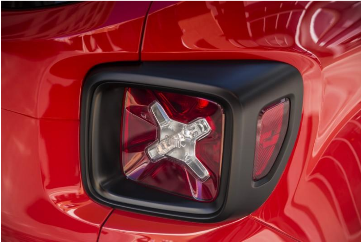
Grill logo in Tail light