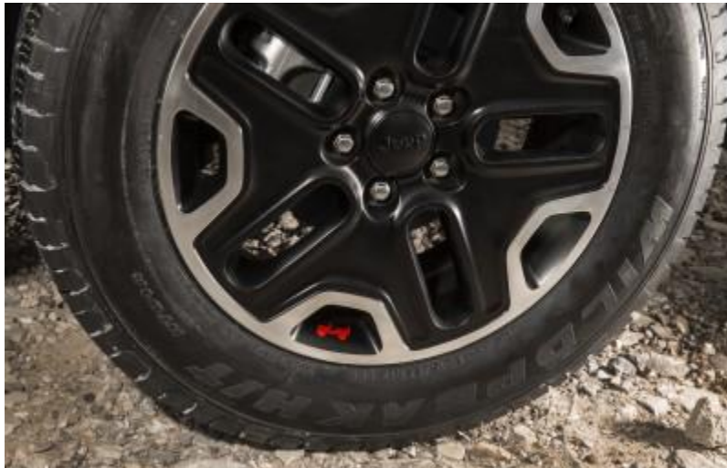
Above: Logo on rim