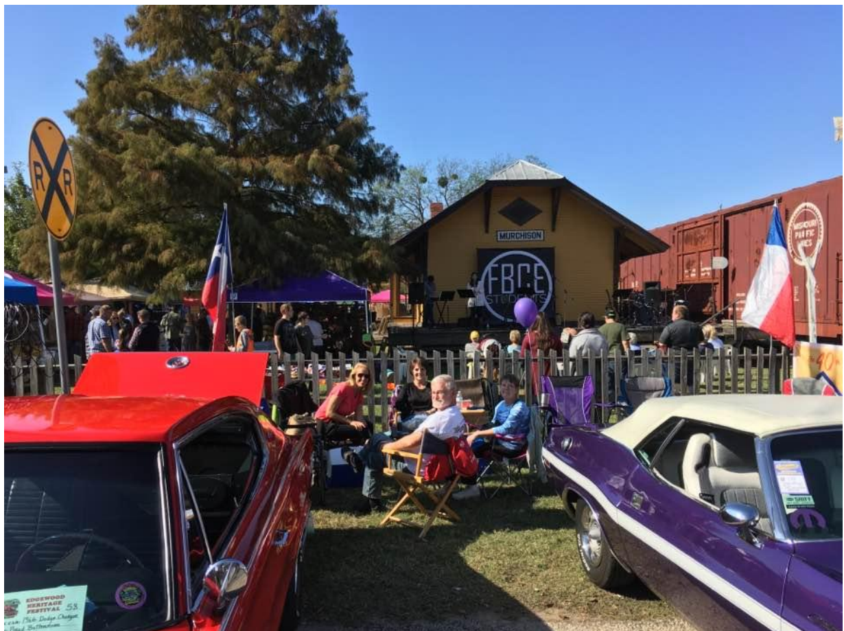
The Edgewood Gang